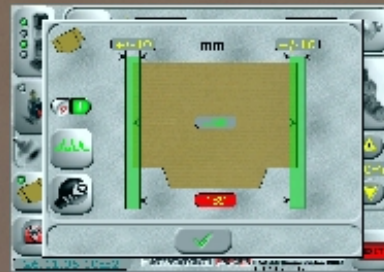
The Valco® Skew Detection System Screen with easy to use icon-based touchscreen.