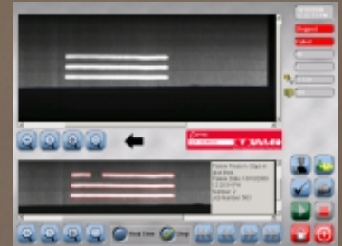
The latest in technology: The Captor™ for in-line quality assurance inspection.