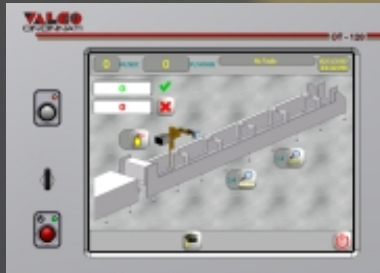
The easy to use Valco® OT-120 touchscreen interface for CartonPro® software.

adhesive pumping systems • pump support systems electronic control devices • application valves applicator heads • mount support systems filters • regulators • cables • glue hoses