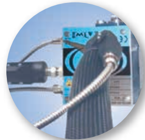
Plate for heat insulation creates a uniform thermal profile.

Multiple hose ports available to customize hot melt supply.